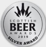
Cloud Fall Best Pale Ale