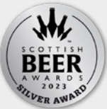
Cloud Fall Best Pale Ale