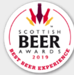
71 Taproom & Tours Best beer experience