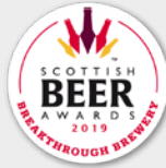
Breakthrough Brewery of the year