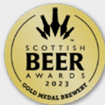
Strawberry Crush Best Sour Beer