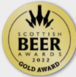
Blackcurrant Apple Crumble Best fruited sour