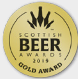
71 Lager Best Pilsner