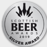
NEIPA Here Nor There Best Juicy or Hazy