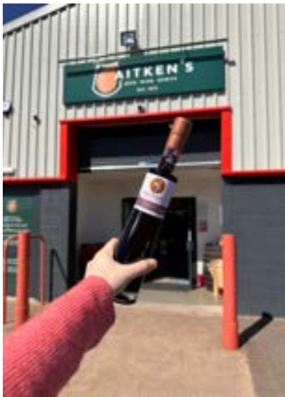
Aitken Wines, Dundee